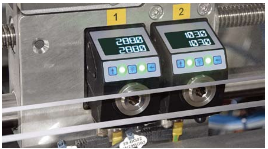
Electronic position indicators AP10 from SIKO for size changeovers: The status LEDs light up green, as the actual and target values match precisely. ©ROVEMA GmbH

The ETIL end-of-line packaging machine for trays with lids enables a particularly precise and productfriendly packaging process. Electronic SIKO position indicators for monitored size changeover can be integrated as an option. ©ROVEMA GmbH