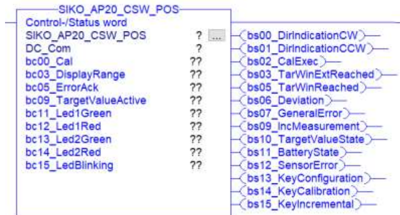
Fig. 2: AOI SIKO_AP20_CSW_POS

This AOI is used to control and receive status information of the SIKO AP20(S) EtherNet/IP™ device in positioning mode. It extends the functionality of the SIKO_AP20_COM AOI by supporting the naming of the control and status word bits according to the positioning mode. It requires an existing instance of the SIKO_AP20_COM, created as controller tag.