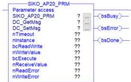
Fig. 4: AOI SIKO_AP20_PRM

This AOI is used to read and write parameters from and to the SIKO AP20(S) EtherNet/IP™ device via explicit messages (class-3 connection). A read or write command takes several PLC cycles. The AOI can read or write an individual parameter acyclically. For this purpose, an instance must be passed to the AOI. The input value is transformed to a DINT (nReceiveValue) and the output value nWriteValue is converted from a DINT to the native format of the parameter.